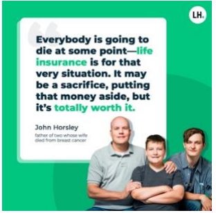
Click image to download

Planning for the "unknown" can show your loved ones that you've got them for life. #GetLifeInsurance