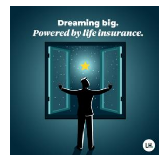
Click image to download

With life insurance, protecting the future of your loved ones is possible. #GetLifeInsurance