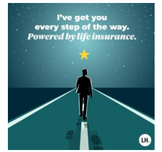
Click image to download

With life insurance, I've got you. #GetLifeInsurance