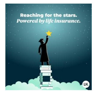
Click image to download

Life insurance can ensure your child's education. #GetLifeInsurance