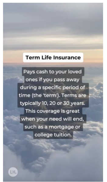
Click image to download

Plus, term life insurance typically offers the most coverage for the lowest initial premium. It's more affordable than you might think! #GetLifeInsurance